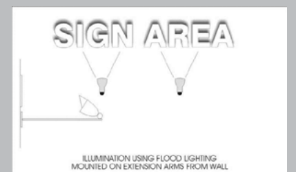
(Externally Illuminated Sign Example)

Externally Illuminated Sign: A sign that is illuminated by a light source directed at the face of the sign. An example is a billboard sign. Externally illuminated signs do not commonly carry UL safety listings.